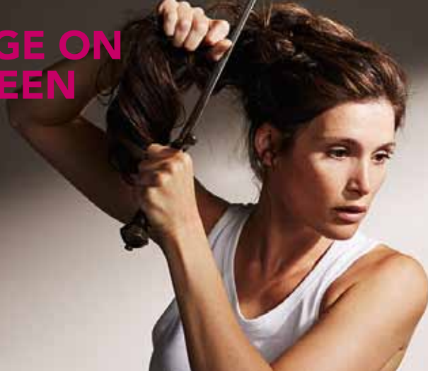
Saint Joan, NT Live