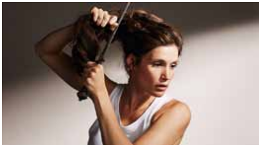
STAGE ON SCREEN / SAINT JOAN