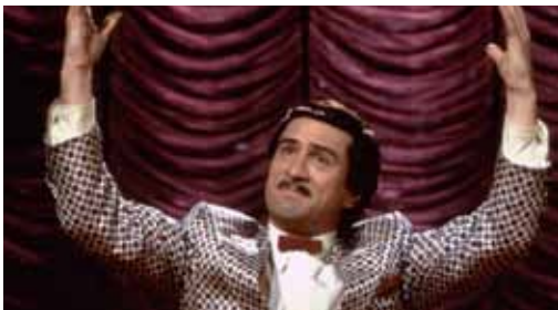
LEARN / STAND UP AT THE CINEMA