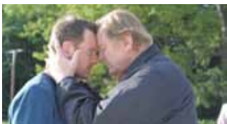
TRESPASS AGAINST US