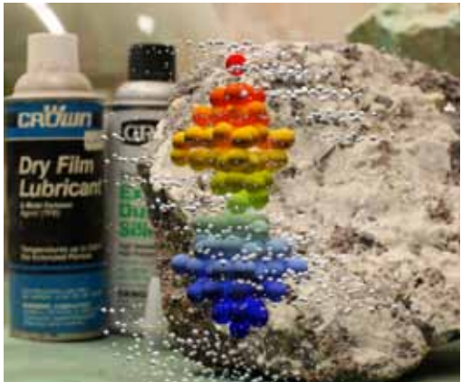
ART / WHERE SHAPES COME FROM