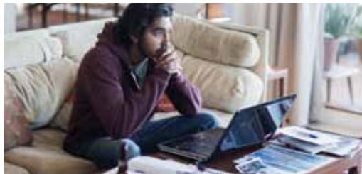
FILM / LION