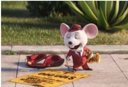
FAMILY / SING