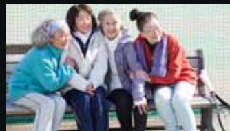
A Sparkle of Life, © 2013 Saitama Prefecture / SKIP city Sai-no-kuni Visual Plaza