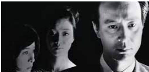
SEASON / JAPAN SEASON