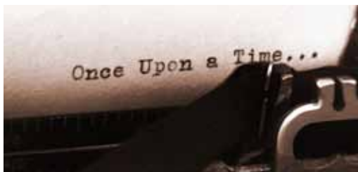
SHORT COURSES / SUMMER 2017