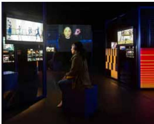
ART / PLAYBACK