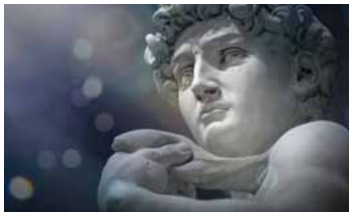
STAGE ON SCREEN / MICHELANGELO: LOVE AND DEATH