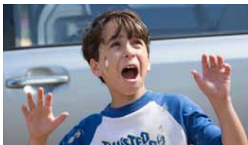
FAMILY / DIARY OF A WIMPY KID: THE LONG HAUL