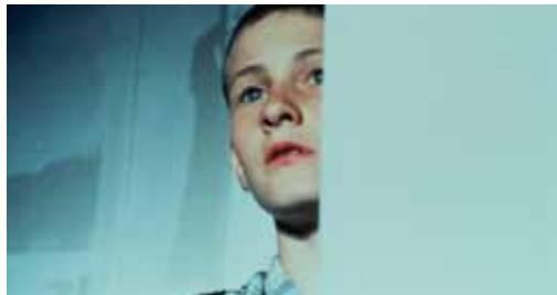
35MM CLUB / RATCATCHER