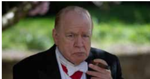
FILM / CHURCHILL