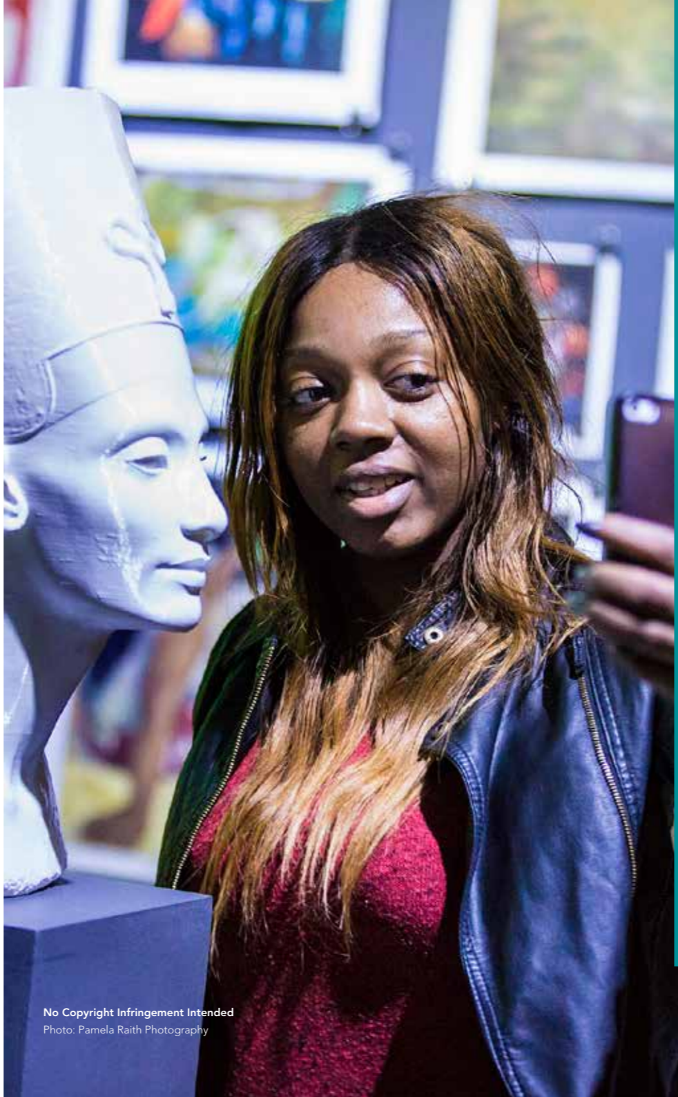
No Copyright Infringement Intended

As an Arts Council England National Portfolio Organisation we are at the forefront of innovation in digital creative media, and our cultural programme explores the impact of technology on society. In 2017/18 we staged 15 major exhibitions and art events in our own Cube Gallery and offsite in venues around the city. We also delivered 28 free creative workshops for children and families, taking our programme beyond the confines of our building into community centres and libraries to widen engagement and reach new audiences.