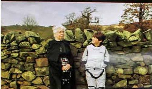
The Short Cinema Film Festival 2017

Independence is the cornerstone of Phoenix as a creative organisation, enabling us to deliver a programme that is relevant to the community we serve and reflects the diversity of our city. In 2017/18 we screened 350 films from 37 countries, reaching more than 101,000 people. Many of these films were not shown anywhere else in the region, and included heritage film and locally-made work. Our film programme also included 14 festivals and seasons – from India on Film and the French Film Festival UK, to Black History Month and the Pride season – opening a window on the world and bringing to our screens fresh perspectives on the breadth of human experience.