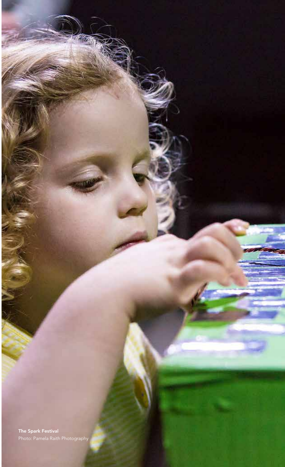
The Spark Festival

Phoenix is also a community hub, providing employment and networking opportunities and bringing creative businesses, volunteers, staff, students and professionals together to support and undertake collaborative projects, contributing directly to Leicester's cultural, social and economic prosperity.