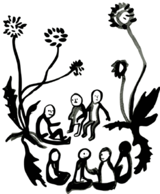
Drawing for Decentralised Networks Workshop for WYFF School, in partnership with BUfU

Careful Networks is an online exhibition which will use an alternative way of organising the internet, known as 'peer to peer' (or P2P for short) to explore more ethical and sustainable ways of creating and sharing art online.